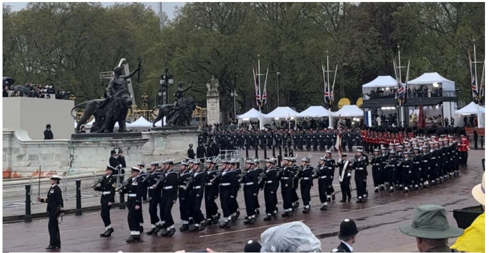
The Royal Navy element of the Coronation Honour Guard circumnavigate the Victoria Memorial having completed the manoeuvre to shrink their frontage to 6 deep from 12.

Shipmates will be glad to know that there is no intention to attempt this manoeuvre at the Naval Associations' Biennial Parade on 10 Sept in Whitehall - nor are we planning to march around half of London! Forming up in King Charles Street between the FCO and the Treasury is perfect for us to march out, less than a couple of hundred yards, and take station at the Cenotaph.