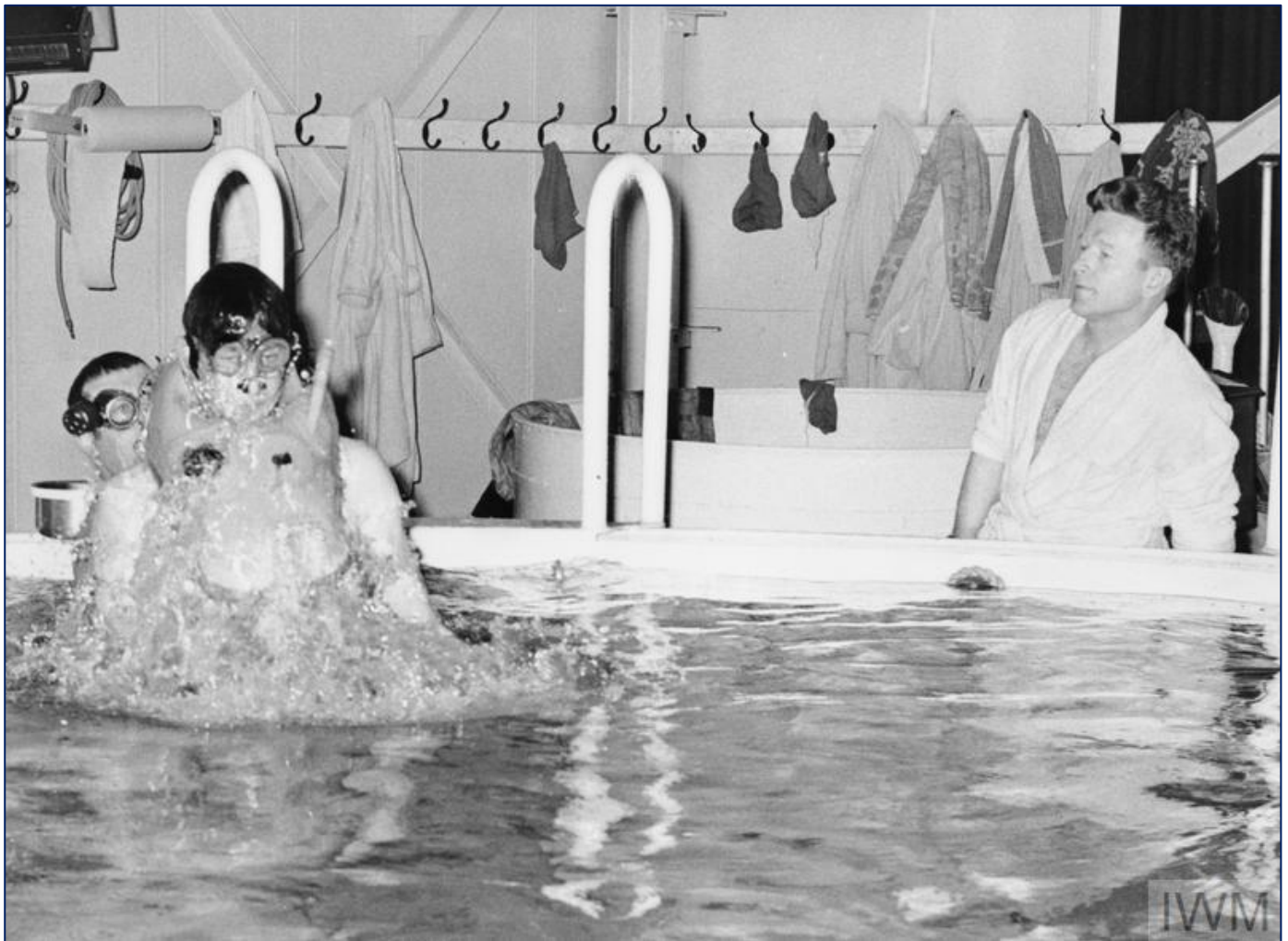
image below, taken from the Imperial War Museum collection), and he also studied communications and navigation at HMS Mercury near Petersfield.